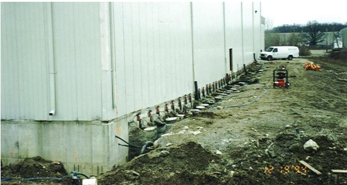
The photo above shows the right side being carefully and gently lifted. Note the hydraulic rams on each pier.