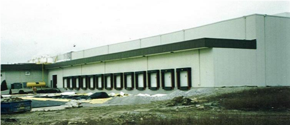
This is a view of the front of the structure. The loading dock shown here had settled 8 inches. Some areas at the right side of this building suffered settlement in excess of 22 inches!

Operations at this warehouse could not continue due excessive floor deflections and from air infiltration. The building was found to have been constructed without adequate soil testing or foundation underpinning. After the structure began to settle, a geotechnical engineer was retained to analyze the soil on the site. He found areas of unstable organic material under the structure.